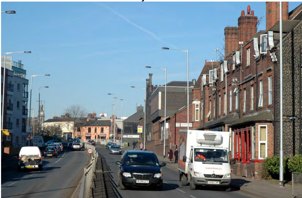
A busy road in the Midlands

Describe one way that data could be collected to investigate the sphere of influence of this road. Your chosen method must take into account the students' aims. [4] AO3