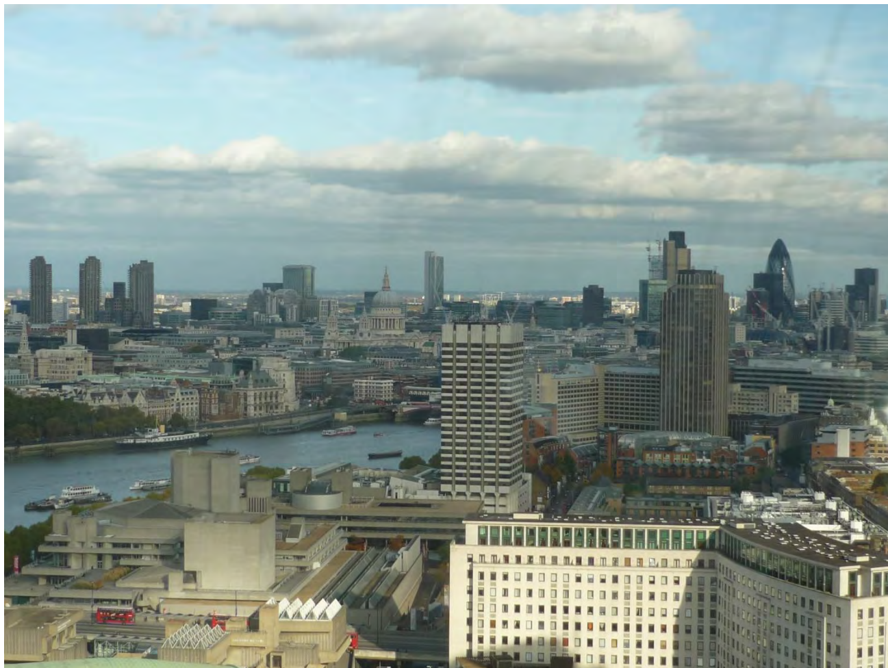
A view across central London

Tick (✓) two hypotheses that could be investigated by using a transect in the environment shown in this photograph. [2] AO3